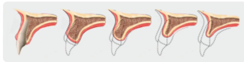
BONE CHANGES DUE TO LOSS OF A TOOTH

In healthy teeth, the root transmits the force of chewing to the alveolar bone. The teeth remain stable and there are no great changes. But when we lose a tooth, beyond compromising the stability of the adjacent teeth, a process of bone loss begins, called resorption.