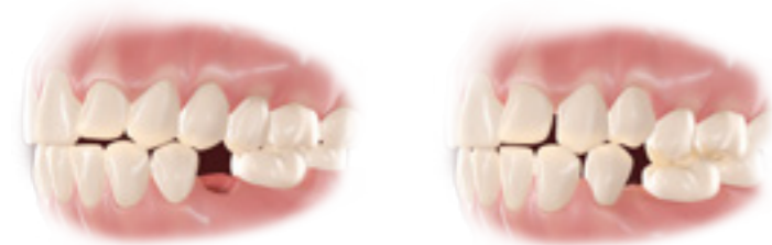
MOVEMENT OF THE TEETH AFTER THE LOSS OF A TOOTH

The teeth naturally receive the force of chewing and, in their absence, the bone ceases to receive stimulation, causing its resorption in height and length. Initially, it may not seem all that serious to leave the tooth's space unfilled, but, as time passes, major changes can take place.